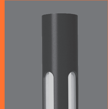
Detailed view of lighting module.