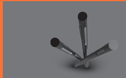
Possible creative arrangement.